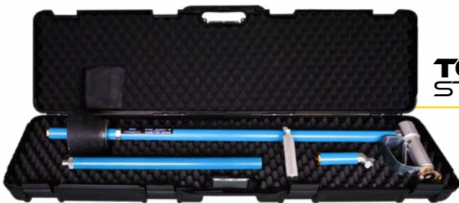
TOOL STORAGE CASE